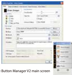
The Button Manager V2 main screen

Button Manager V2 makes it easy for you to scan and send your image to your favorite destinations with a press one button. Now the new version comes with an innovative feature to let you scan and automatically upload the scanned document to popular cloud repositories such as Google Docs, Microsoft SharePoint, or FTP. In addition, the iScan feature allows you to insert the scanned image or recognized text after optional OCR (Optical Character Recognition) process to your text editor such as Microsoft Word to get your job done easily and quickly.