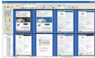
The AVScan X main screen

-The Intelligent Document Management Tool