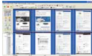
The AvScan 5.0 main screen

-The Intelligent Document Management Tool